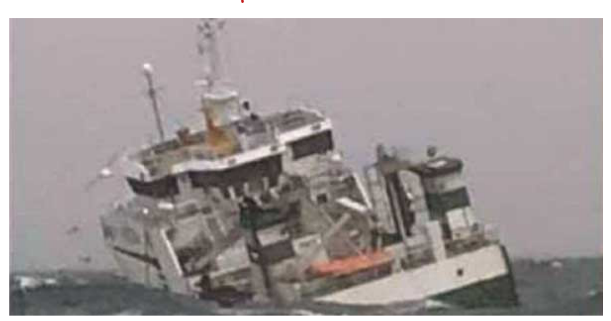
Twenty-eight Unifor members were rescued in high-wind conditions on March 2 after their vessel, the Atlantic Destiny, caught fire off the coast of Nova Scotia.