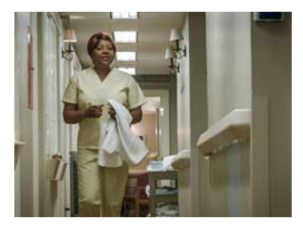
Ontario's Program for 6,000 new PSWs is a good start to fixing the crisis in long-term care.