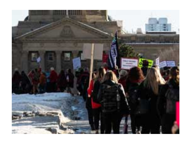
For Alberta families struggling under a pandemic and a slumping economy, budget cuts will only make matters worse.