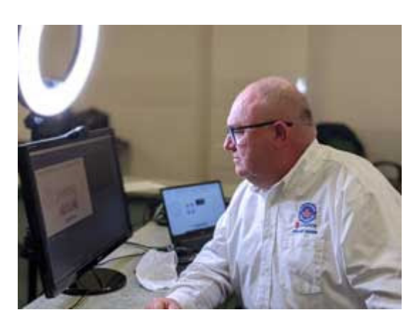
Unifor Skilled Trades Council supports next generation of apprentices through a new partnership with the Rexdale Pathways to Education program.