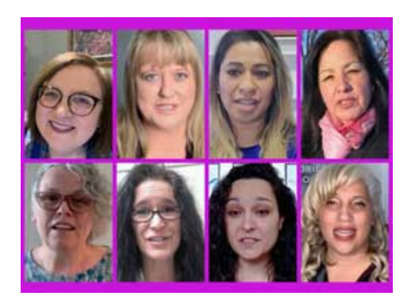
Check out our new series of videos celebrating powerful Unifor women as we get ready for International Women's day.