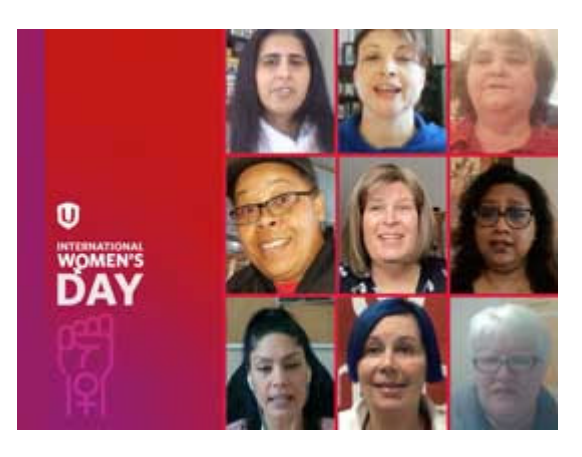
Don't miss out! Register for the online Unifor International Women's IWDigital gathering March 8 on Zoom.